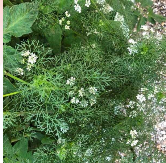
Coriander in flower.

I am happy to recommend Ayurvedic medicines - those that contain no heavy metals but do contain the natural chelating plants (like coriander) identified by Thuppil and Tannir (2013) - for detoxing lead and other heavy metals. Once more Ayurveda medicine manufacturers aim to keep heavy metals out of their products, wouldn't that fuel a resurgence of Ayurveda and an acceptance in Western countries of the safety of Ayurvedic medications, and their therapeutic value, that would potentially benefit billions of people both outside and inside India?