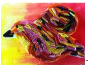
'Lava Bird' by Meerab Imran