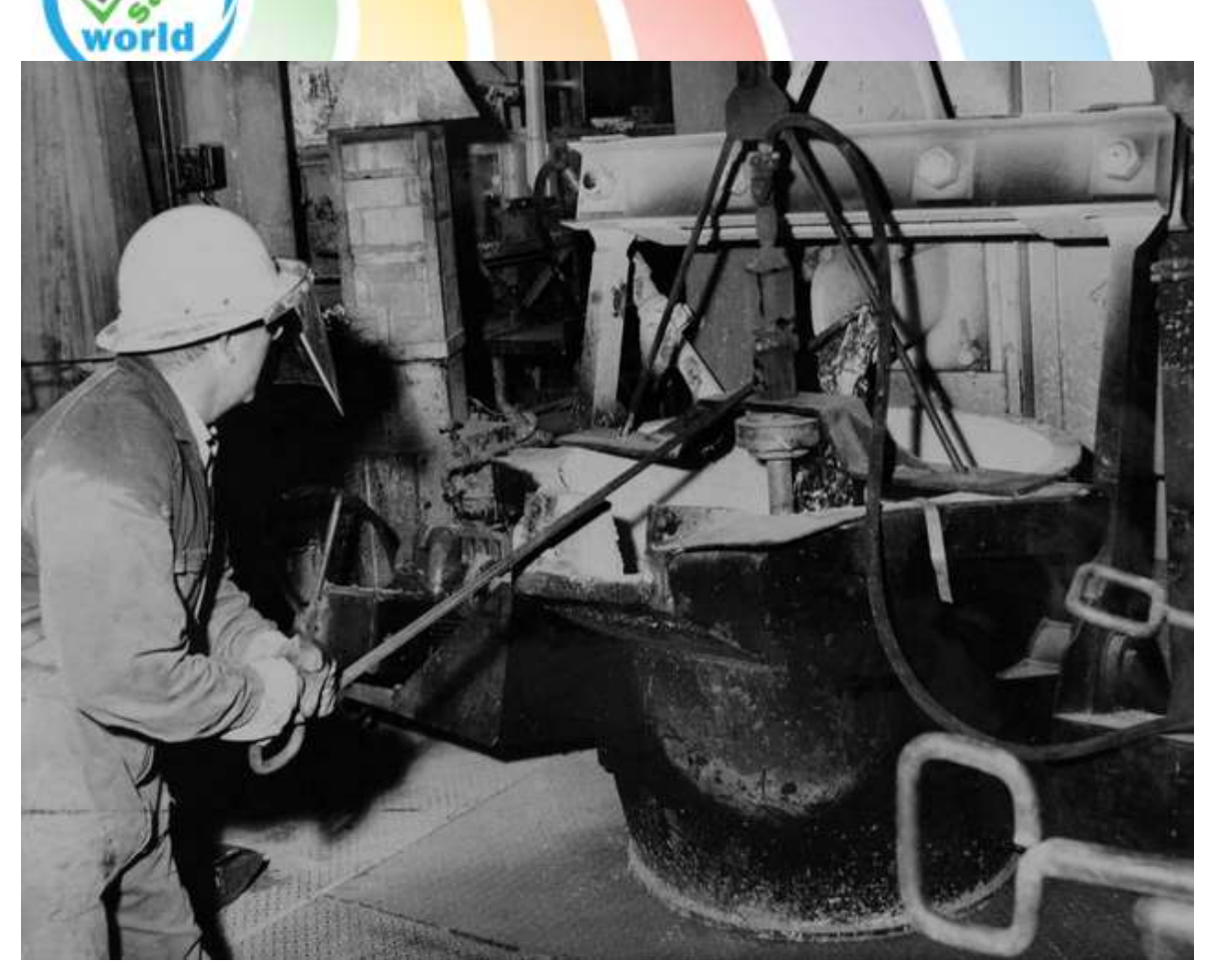
November 1986: Pasminco Smelter

A decade after Pasminco closed its smelter at Boolaroo and as the remediated site is due to reopen with new residential and business development, the Newcastle Herald examines the impact of the remaining contamination and how it continues to affect the area.