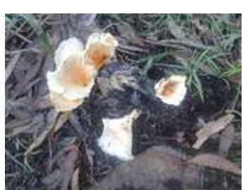
'Bushfires & mushrooms can increase lead concentrations' by Sue Gee