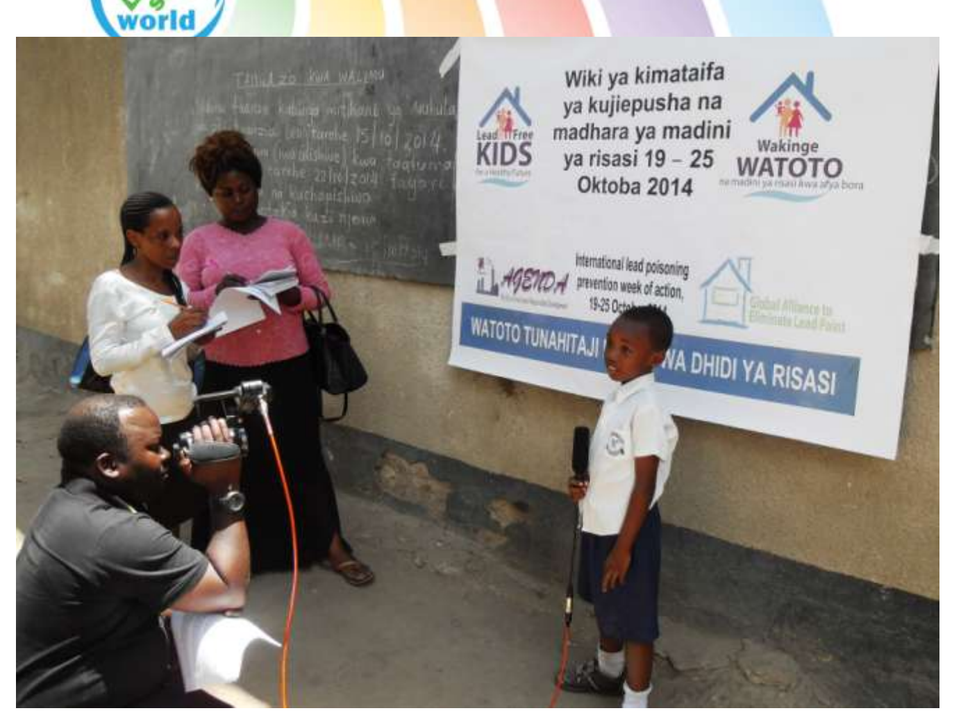
Thailand - Lead Poisoning Prevention Campaign Launched to Save Young Kids

(http://englishnews.thaipbs.or.th/lead-poisoning-prevention-campaign-launched-save-young-kids)