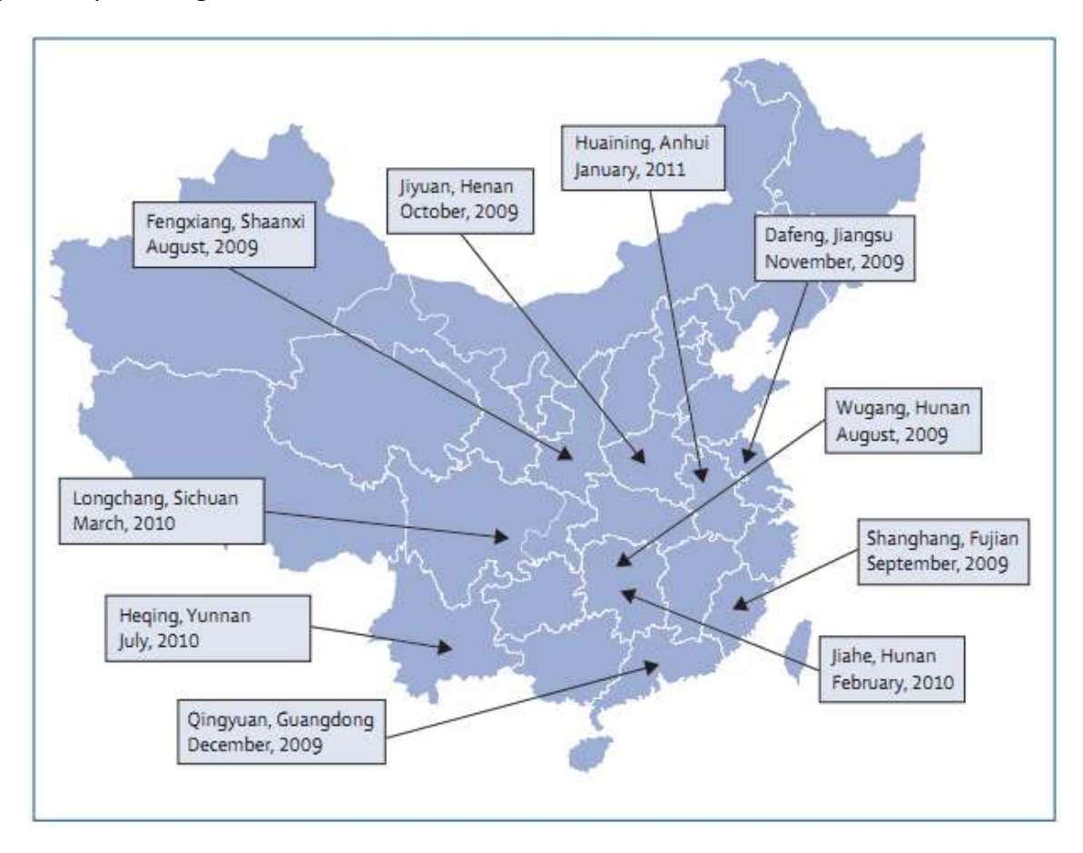
Figure 2: Major lead poisoning cases in China since 2009.

In 2011, authorities in Gaohe, in the eastern Anhui province of China, closed two battery plants they blamed for causing lead poisoning of people living in close proximity. Among those affected were children just a few months old, with one being found to have a blood level of 24.5 \mu g/dL, and displaying symptoms of lead poisoning, such as lack of appetite and fatigue. Furthermore, residents said that children who tested above 25\mu g/dL were sent to a children's hospital for treatment, but those who were below were left with nothing more than 400 yuan ($60) and a box of apples and bananas by the local government. While the plant opposite from the complainants was shut down, another plant further away is still in production (Chan 2011). These incidents are but a few out of a myriad of lead poisoning cases since just 2009, where until now more than 4000 children have been affected by lead poisoning (Ji et al 2011). Figure 2 below summarises areas of major lead poisoning cases in China since 2009.