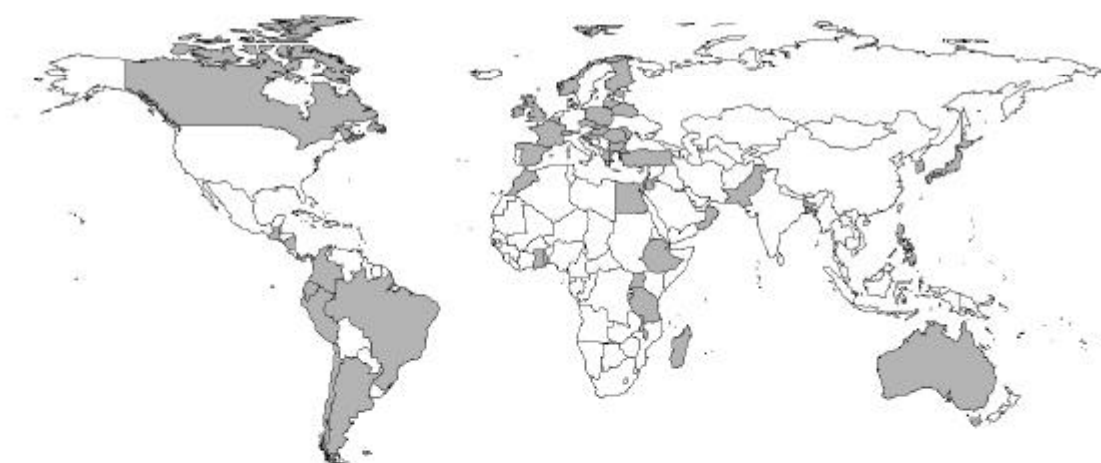
Figure 1 Countries that have provided responses to the "Questionnaire on the Status of Government Efforts to Phase Out Leaded Gasoline"

Responses from Governments to the questionnaire were received from sixty-two countries; 11 from Africa; 9 from North and Central America and the Caribbean Regions; 6 from South America; 11 from Asia; 23 from Europe; and 2 from Oceania. Information received through these responses has been compiled in Annex 1 "Compilation of responses received to the Questionnaire on the Status of Government Efforts to Phase Out Lead in Gasoline".