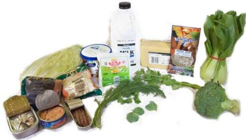
Calcium: This nutrient has many sources Back row: Chinese cabbage, yogurt, milk, cheese, aniseed seeds (fennel), bok choy Middle row: seeds (poppy, sesame), tofu and coriander Front row: Fish (sardines, salmon anchovy), dill, kale, broccoli. Not pictured: Chinese spinach (aramanth), mustard greens.

For vegans (who do not consume animal products) or lactose intolerant individuals (most south Europeans, south and central Africans, native Americans, Australian aborigines and east Asians) the best sources of calcium are tofu made with calcium sulfate, bok choy, choy sum, mustard greens, chinese spinach (aramanth), kale, some seeds (poppy, fennel or sesame) and various fish, particularly if consumed with their bones (notably sardines, salmon and anchovy). Calcium absorption is significantly inhibited by oxalates (in many dark green vegetables, most berries, some nuts or seeds, legumes, cocoa, chocolate and black tea) though several studies indicate this predominantly affects only the calcium in the oxalate rich food while phytates (in whole grains, bran, nuts or seeds) reduce calcium absorption by as much as 65% from any food consumed with them. Caffeine, tannins (found in tea) and phosphates other than phytates (such as are found in soft drinks) can inhibit calcium absorption but appear to have little impact on well nourished individuals. From animal studies it appears alcohol, particularly when combined with lead, depletes calcium in body organs potentially increasing lead uptake.