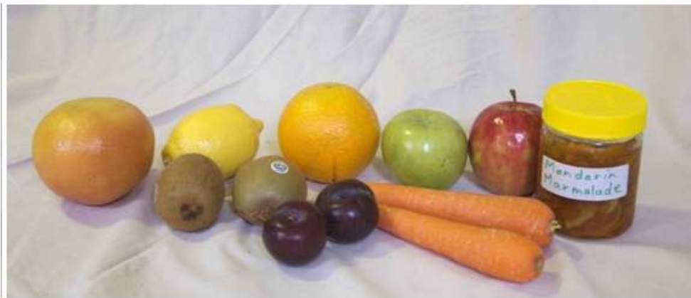
Pectin: is contained in the following fruit. Rear row; pink grape fruit, lemon, orange, apple Front row: Kiwi fruit, plums, carrots, mandarin marmalade

Pectin According to Wikipedia, “[Pectin] is produced commercially as a white to light brown powder, mainly extracted from citrus fruits, and is used in food as a gelling agent particularly in jams and jellies. It is also used in fillings, sweets, as a stabilizer in fruit juices and milk drinks and as a source of dietary fiber.” Wikipedia also gives the following concentrations of pectin in foods: Apples (1–1.5%), carrots (1.4%) apricot (1%), quince, plums, gooseberries, oranges (0.5–3.5%) and other citrus fruits (citrus peels 30%) contain much pectin, while soft fruits like cherries (0.4%), grapes and strawberries contain little pectin.