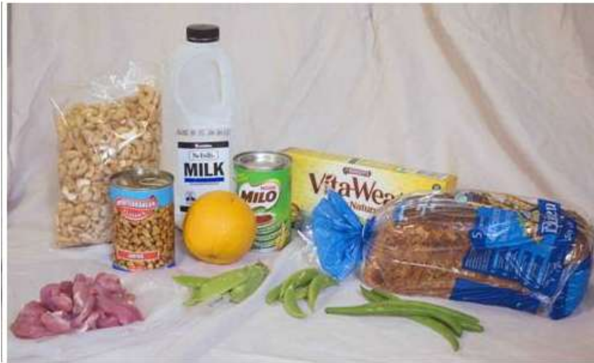
Vitamin B1: the above items are rich in thiamine Top row: nuts (cashew nuts pictured), milk, Milo, whole-grain biscuits (Vita-Wheat) Middle Row: lentils, orange, whole grain bread Bottom row: pork, snow peas, peas, beans.