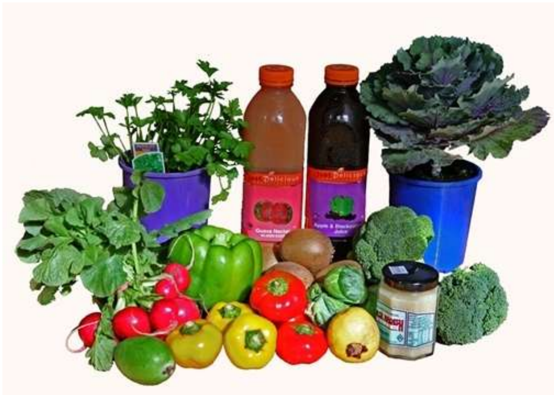
Vitamin C: 480 g of the foods (pictured above) eaten raw should provide sufficient Vitamin C to reach 400 mg a day (much more if cooked, for juice equivalent check labels). Top row: parsley, guava (juice pictured), blackcurrant (juice pictured), kale Middle Row: radish, capsicum (bell pepper in US), kiwi fruits, broccoli Bottom row: feijoa, baby capsicums, brussel sprouts, guava, horse radish Not pictured: Mustard greens, red peppers, thyme

For healthy young non-smoking adult individuals, 400 mg a day, a minimum recommended by the Linus Pauling Institute, seems both a reasonable and safe dietary goal, though this may not be adequate for all sectors of the population as vitamin C absorption may decline with age, or may be impacted by smoking, diet (including alcohol) or medication. High levels of vitamin C reduce the risk of Helicobacter pylori infections that can reduce stomach acidity, in turn reducing iron, zinc, copper, calcium and B12 absorption.