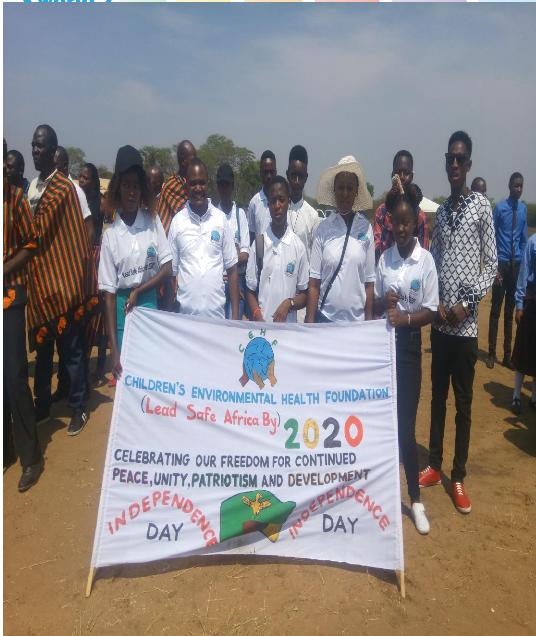
CEHF team participation during the Zambia's Independence Celebration in Livingstone Tourist Capital City on 24 th October 2017.