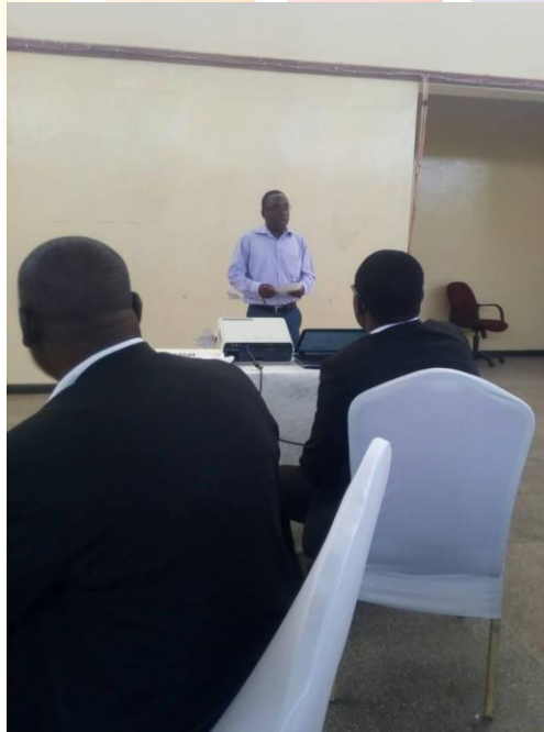
Paint representative for Zambia manufacturer association making responses on behalf of the manufacturers