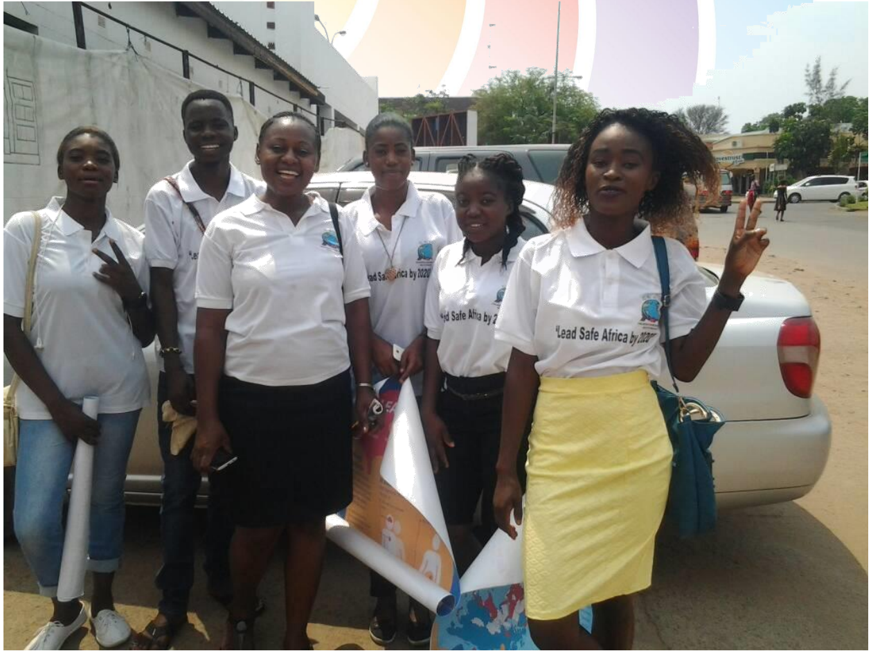
CEHF team after field visitation in the Livingstone District business center