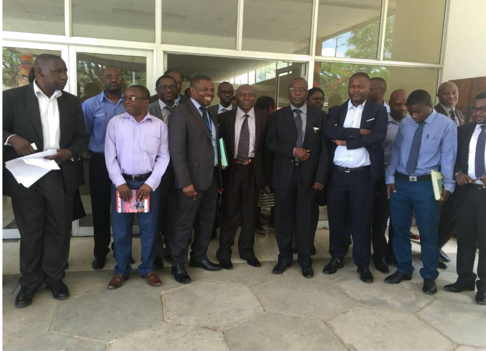
Part of the delegates pose for a group picture