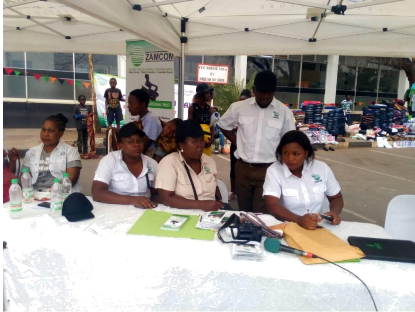
Part of ZAMCO and Livingstone Press club looking at the press release