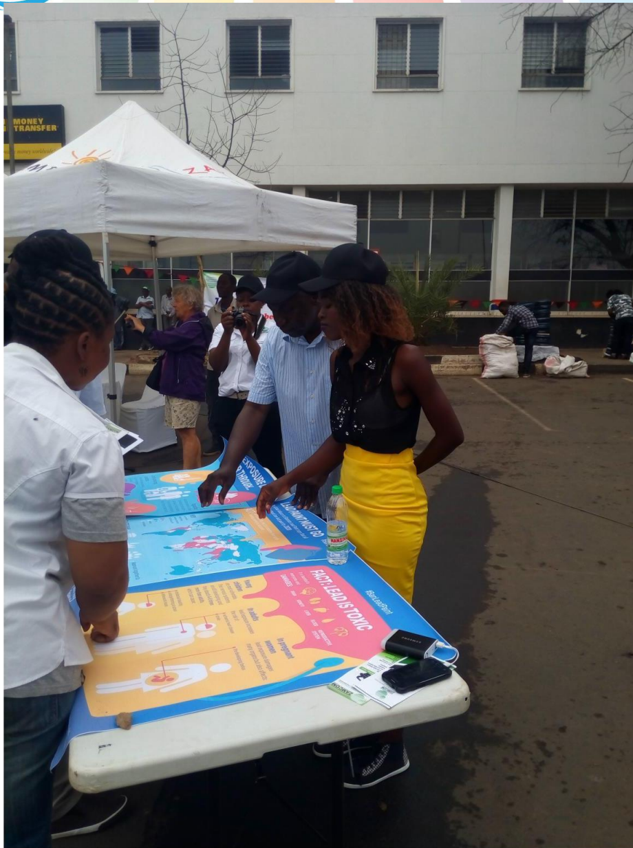
The media listens to CEHF team explanation on countries having legally binding regulations on lead in paint.