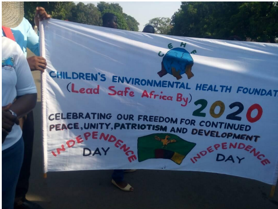
CEHF Banner displayed at the Independence day celebration – Livingstone