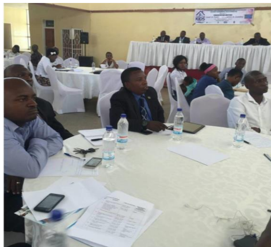
Part of the participants following the presentation