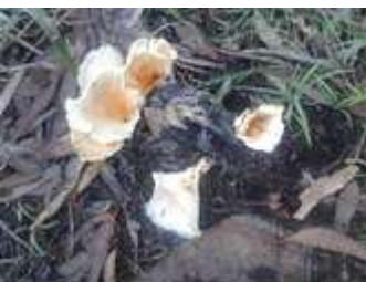
'Bushfires & mushrooms can increase lead concentrations' by Sue Gee