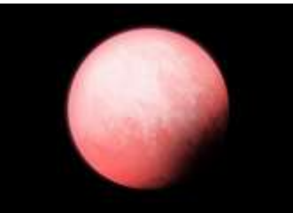
'Planet Astari' by Yiru Rocky Huang