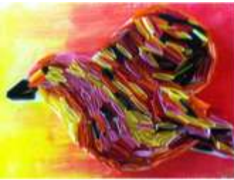
'Lava Bird' by Meerab Imran