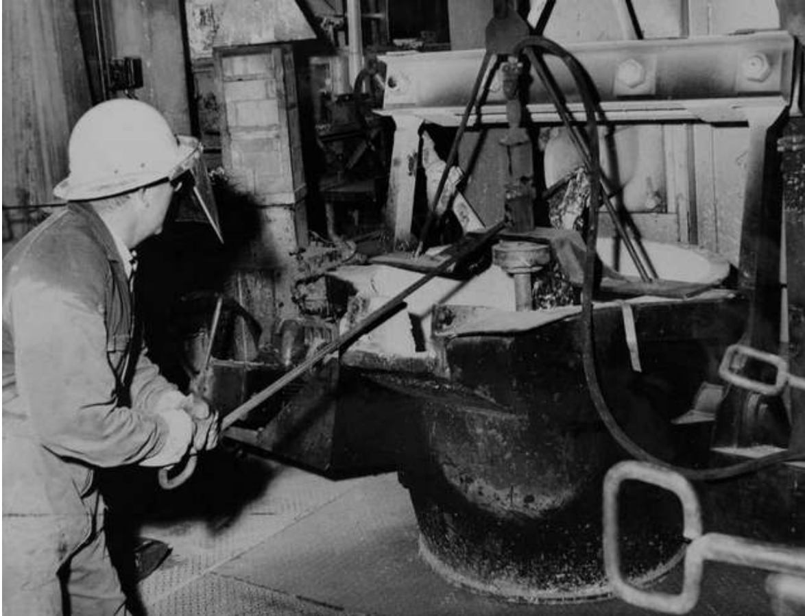
November 1986: Pasmaico Smelter

A decade after Pasmaico closed its smelter at Boolaroo and as the remediated site is due to reopen with new residential and business development, the Newcastle Herald examines the impact of the remaining contamination and how it continues to affect the area.